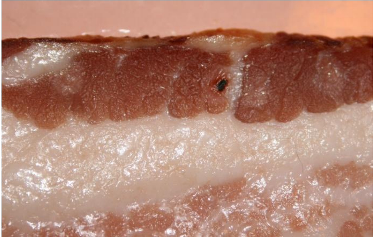
Figure 4. Laser-charred bacon. Lasers are not a cost-effective method of bacon preparation