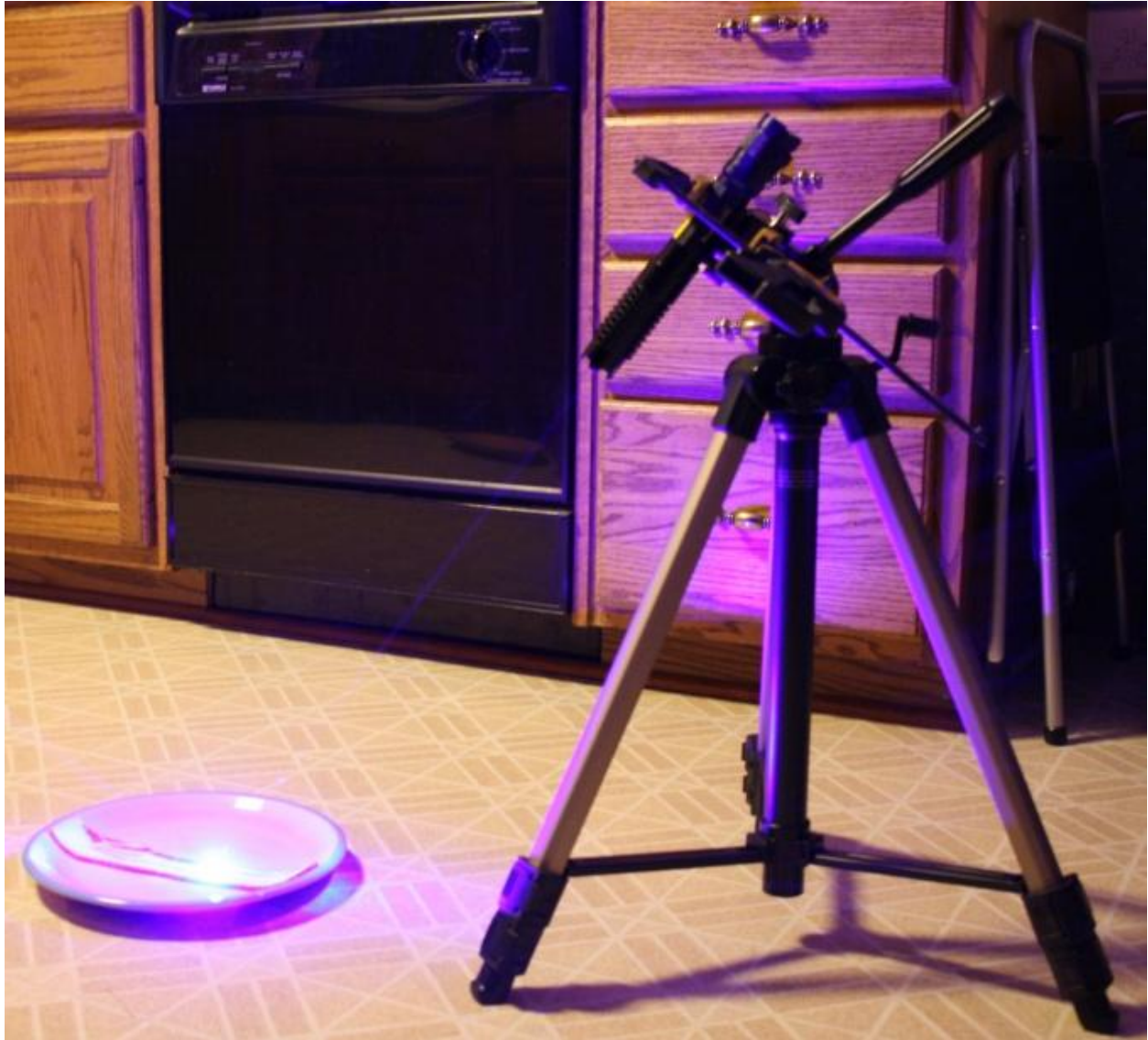
Figure 1. Laser zaps test bacon on floor of Straight Dope Kitchen of Science. Note laser's cool light saber-like design.